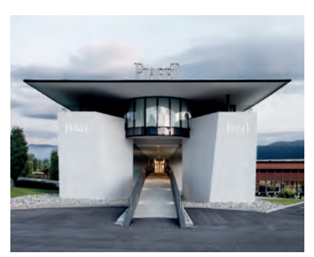
Piaget's Manufacture and headquarters, Geneva

Piaget began in 1874, with a unique vision: always push the limits of innovation to be able to liberate creativity. Positioned as a reference for precious watches and known for its audacity, it enjoys unrivalled credentials as both a watchmaker and jeweller. Two fully integrated Manufactures enable the Maison to reaffirm its unique expertise in gold and jewellery crafting as well as ultra-thin movements.