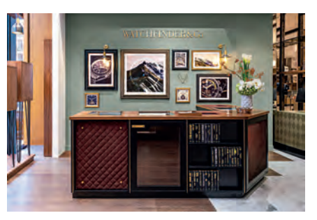
Watchfinder at Bongénie, Geneva

Founded in 2002, Watchfinder buys, services and sells pre-owned watches. It is the recognised leader in this business area. Watchfinder operates both online and through its network of boutiques and showrooms, predominantly in the UK, enabling it to reach customers wherever they are through a fully integrated, omni-channel approach.