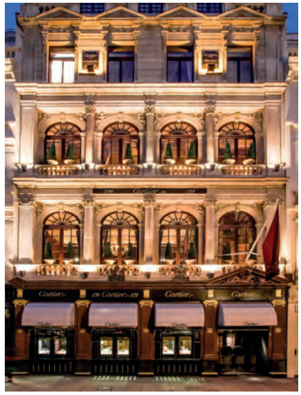
Bond Street boutique, London

Founded in 1847, Cartier is not only one of the most established names in the world of jewellery and watches, it is also the reference of true and timeless luxury. The Maison Cartier distinguishes itself by its mastery of all the unique skills and crafts used for the creation of a Cartier piece. Driven by a constant quest for excellence in design, innovation and expertise, the Maison has successfully managed over the years to stand in a unique and enviable position: that of a leader and pioneer in its field.