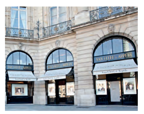
Van Cleef & Arpels on Place Vendôme, Paris

Created in 1906, Van Cleef & Arpels is a High Jewellery Maison embodying the values of creation, transmission and expertise. Each new jewellery and timepiece collection is inspired by the identity and heritage of the Maison and tells a story with a universal cultural background, a timeless meaning and which expresses a positive and poetic vision of life.