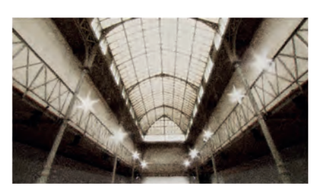
7 rue de Moussy, Paris