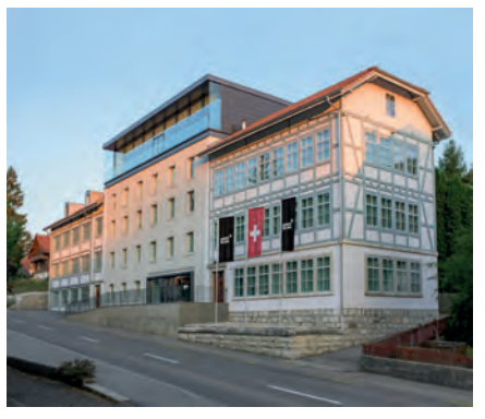
Montblanc Manufacture, Villeret, Switzerland

For over a century, Montblanc's writing instruments have been the symbol of the art of writing. Driven by its passion for craftsmanship and creativity, Montblanc provides elegant, sophisticated and innovative creations in the fields of fine watchmaking, fine leather, new technologies and accessories.