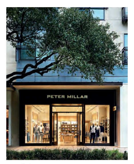
Peter Millar boutique, Austin, Texas

Peter Millar designs classic, luxury sportswear embracing timeless style with a modern twist. Displaying superior craftsmanship, unexpected details and the highest quality materials from the finest mills in the world, Peter Millar lifestyle apparel offers a distinctive vision of casual elegance.